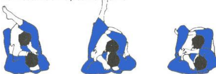
Ashi-Gatame-Jime / Sankaku-Jime

At this point he knew that he was desperately in trouble